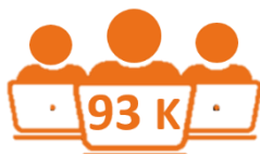
VISITORS (on the aiba website)