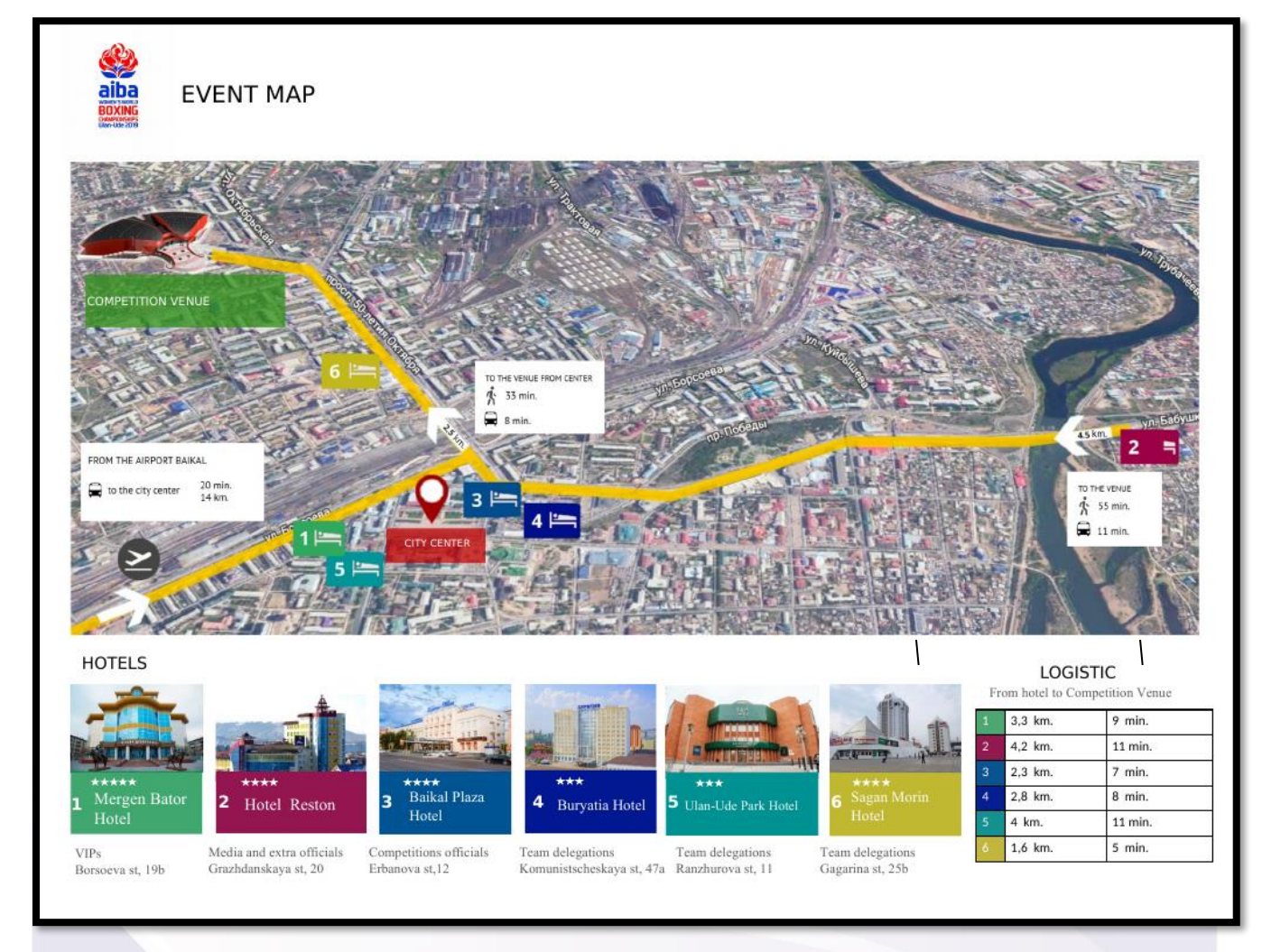
Team Delegations are requested to submit their choice and needs through AIBA Database before: Wednesday, August 14, 2019 (23:59 GMT)

In order to fit all budgets, The LOC and AIBA have agreed to propose 3 different kind of Hotels to the Team Delegations. They are all located in the city center 1,6 - 4 km from the Competition Venue.